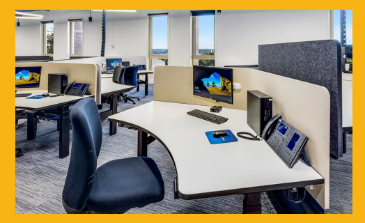
FLEXIBLE Solutions specifically for your workspace