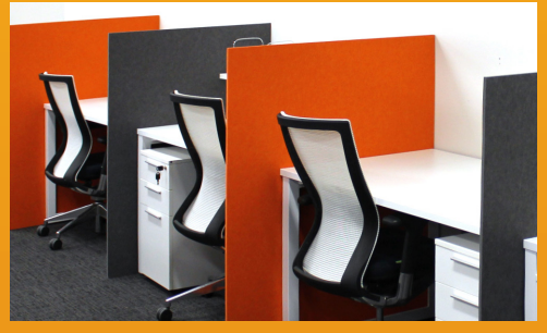
FAST Series of integrated solutions